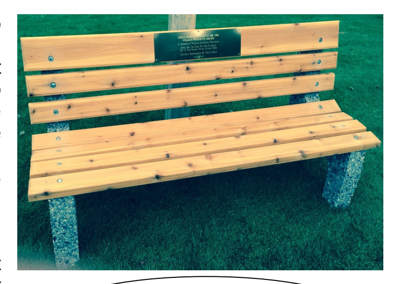
LOCATED IN FRONT OF THE "G" CLUSTER

We have had an overwhelming response to the offer of memorial benches to be built and placed on site and we continue to send out the offer to all owners who may wish to do this. We have had 15 ordered to date! The fee to have a bench built and placed on site in the area of your choice is $350 + tax. This includes all materials to build as well as a plaque dedicated to your loved one. If you are interested in having a bench built in memory of someone, please contact David DuPont b y email info@mountainsidevillas.com or call him at 1-855-345-6341 x 21. Once complete, the bench will look like the one to the right.