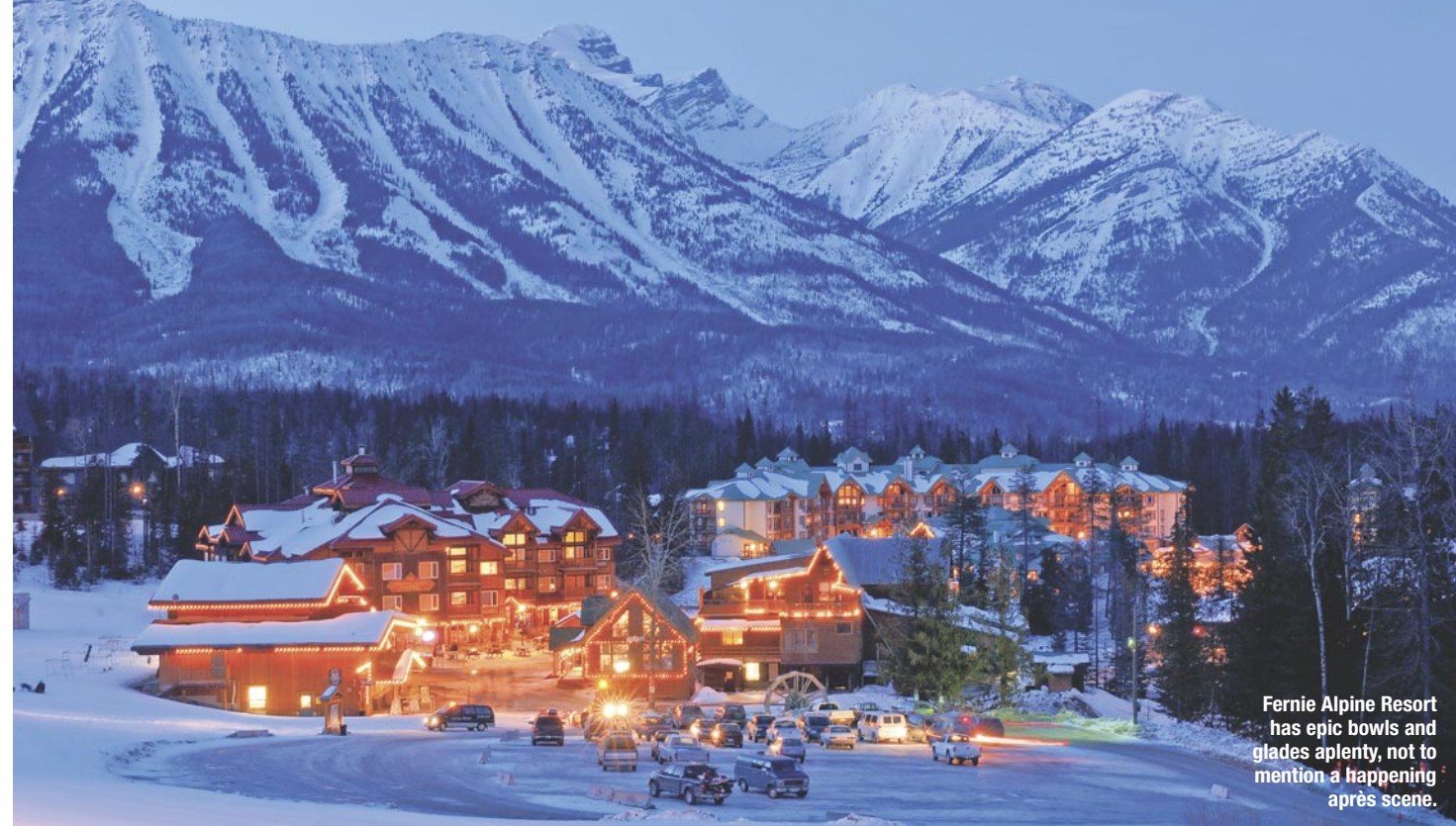
Fernie Alpine Resort has epic bowls and glades aplenty, not to mention a happening après scene.

attention to why I love winter in this region: the myriad outdoor recreation. Fittingly, Radium Hot Springs is a convenient waypoint along British Columbia’s mythical Powder Highway, a route that connects eight distinct ski resorts known for diverse terrain and some of North America’s best snow conditions. While I’ve tackled — some would argue insanely — all eight in a single feast, biting off half proves a much more palatable trip, so the next morning I turned south and headed toward Panorama, one of the Highway’s diamonds in the snow bank.